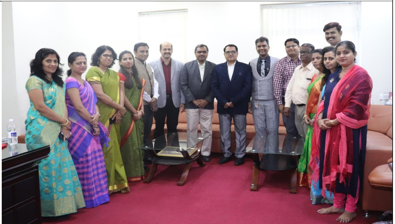
Group photo -Faculty members along with resource persons and director of the institute