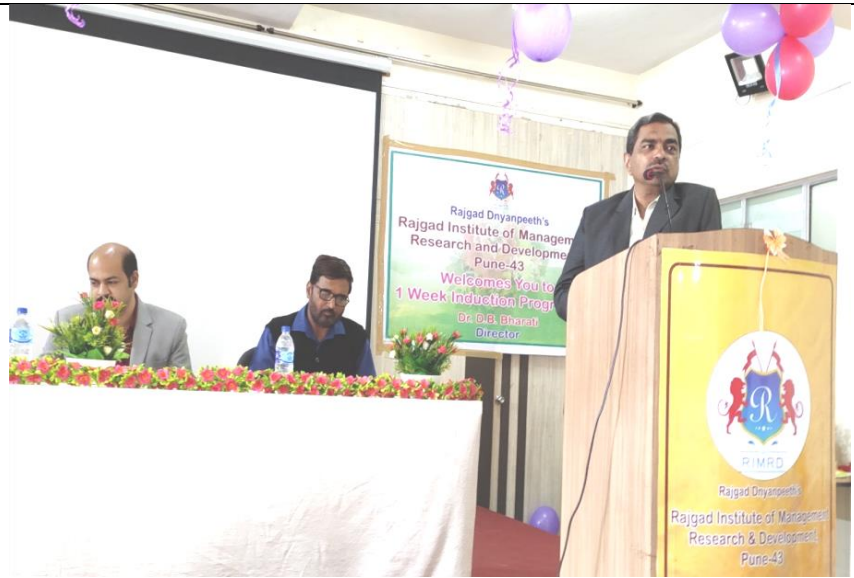
MBA-Ist year students at Induction Programme