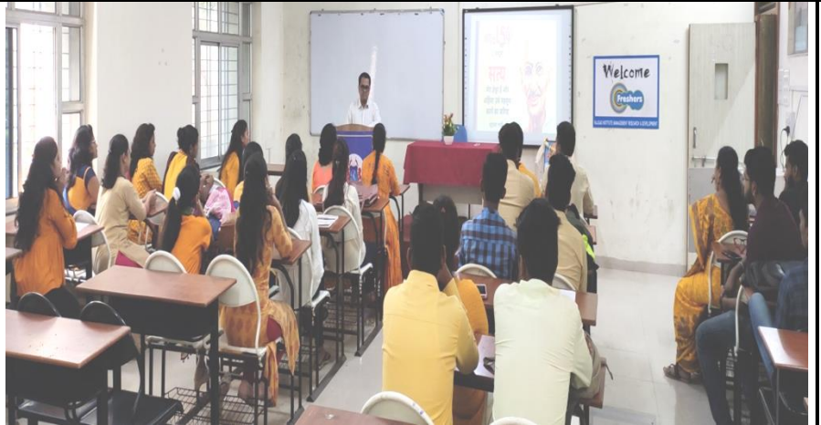
Navratri Celebration - Yellow Day