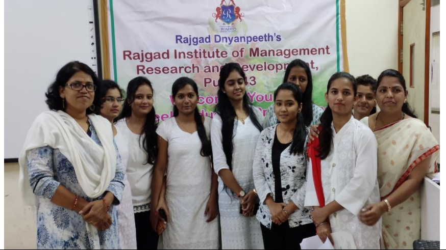
Celebration of Mahatma Gandhi Jayanti and Bhajan Programme