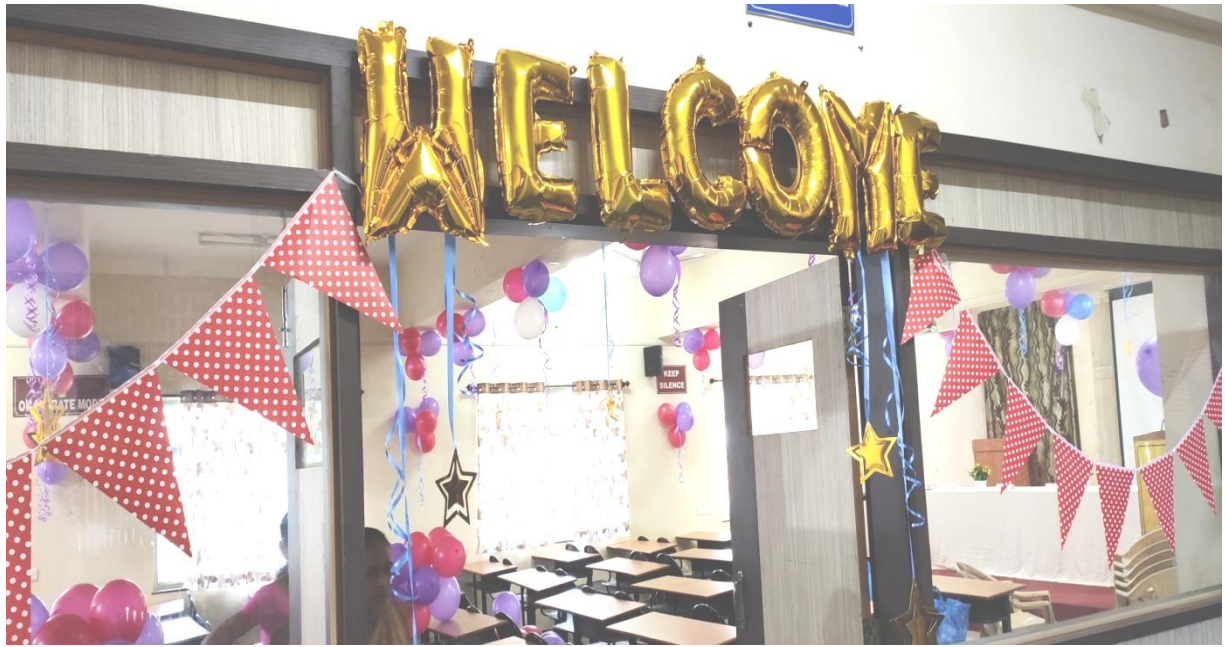
Welcome to MBA-I st Year Students